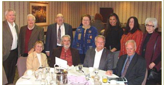
ALUUC members at MLK Breakfast.

ALUUC, about which additional information is being included in this newsletter: (1) the Annual Meeting of the Central Midwest District of the Unitarian Universalist Association April 27-29, 2012 in Oak Brook, Illinois; and (2) the General Assembly of the national Unitarian Universalist Association June 20-24, 2012 in Phoenix, Arizona. Members are encouraged to attend, and those attending may be appointed as delegates representing the ALUUC.