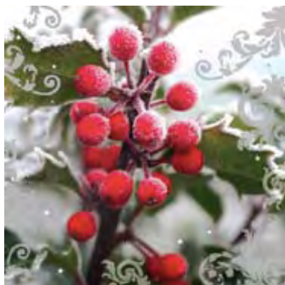
"Winter Berries" 5 x 5" Message inside: Wish you a season of peace and joy!

All packs are $10 for 10 cards/envelopes