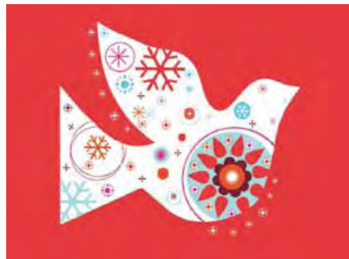
"Peace Dove" 5" x 7" Message inside: Joyful holiday tidings of peace.

All packs are $10 for 10 cards/envelopes