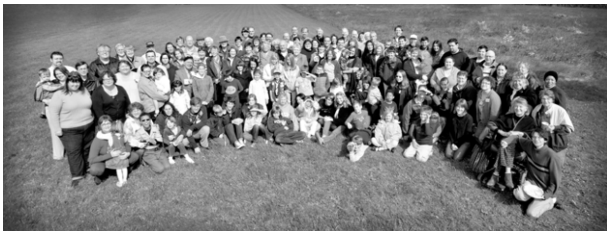
ALUUC Congregation Portrait