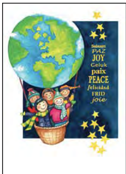
"Children and World" 5" x 7" Message inside: Wishing you a world of peace this holiday season.

Equal Exchange's mission is to build long-term trade partnerships that are economically just and environmentally sound, to foster mutually beneficial relationships between farmers and consumers and to demonstrate, through our success, the contribution of worker co-operatives and Fair Trade to a more equitable, democratic and sustainable world.